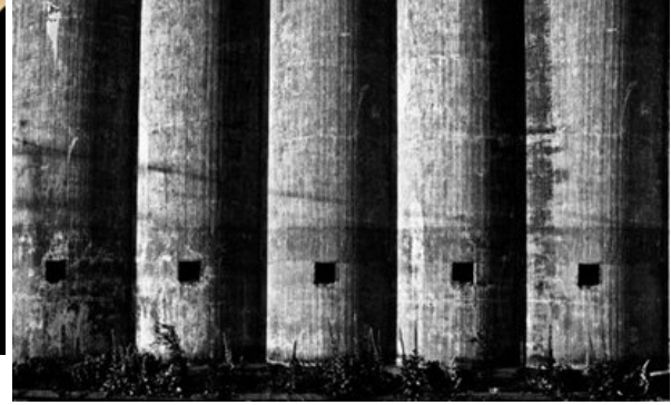
Abandoned Grain Elevator

The strong vertical pattern of these abandoned grain elevators creates a dynamic tension. Using the MC Picture Control and increasing the contrast serves to highlight the "lines within lines" of the texture of the concrete. Leaving the plants in the foreground adds a bit of an organic element to an otherwise harsh composition.